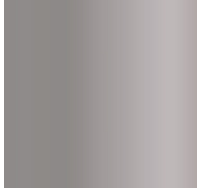
Matte White Lacquer - MWL